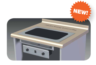
Tabletop 2-zone GN 1/1 unit