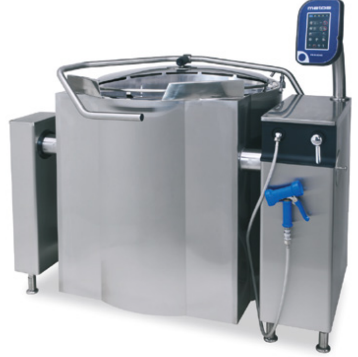
Metos Proveno 400E free standing