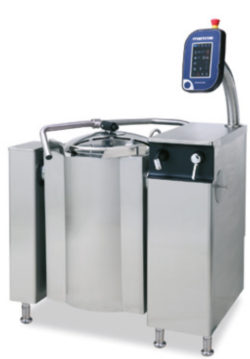
Metos Proveno 100E free standing