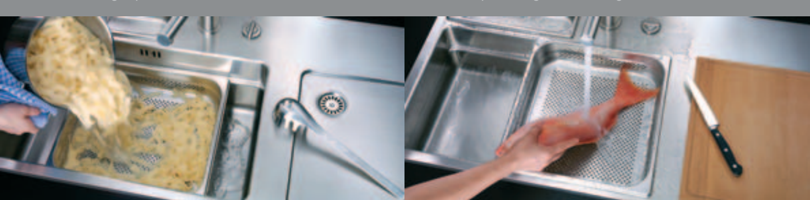
Simple scaling and seasoning of fish