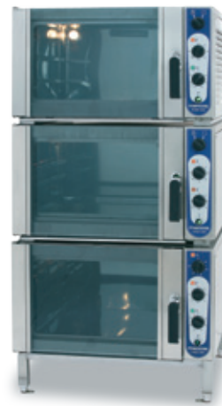
Oven group Chef 220