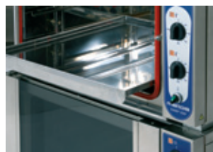
Chef 220 inside