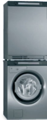
SC65 + DAM6