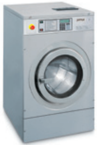
RS7 / RS10