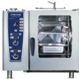
Combimaster Plus 61