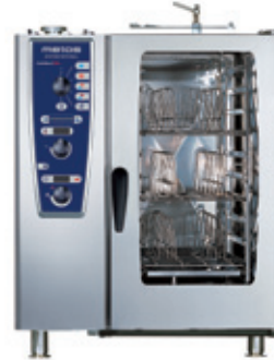
Combimaster Plus 101