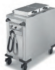
Ultra dispenser, for energy efficient heating and storage of bowls.