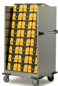
Specialist transport trolley (Rolli 10)