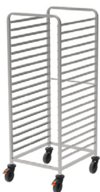
Open rack trolleys of all sizes