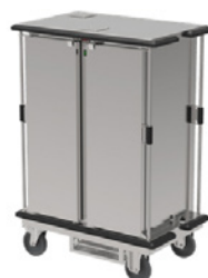
Closed tray trolleys